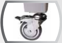
Heavy duty casters